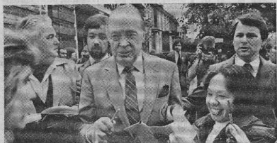
Back to his birthplace... Hope freely distributes jokes and autographs

COMEDIAN Bob Hope was back in his English birthplace yesterday—79 years after he first appeared there.