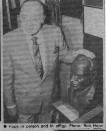
● Hope in person and in effigy.

WISECRACKING comedian Bob Hope came home to Eltham last week to open officially a theatre named after him.